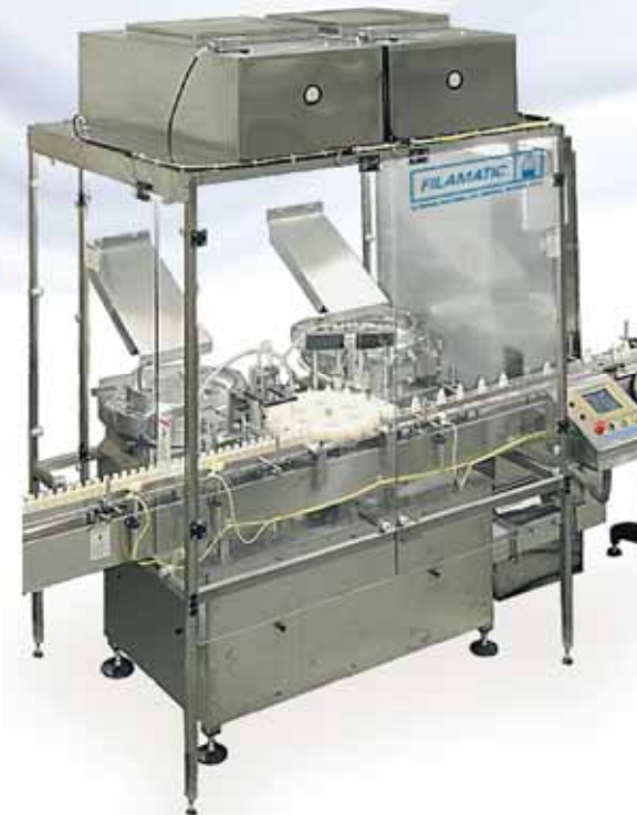
MNB 2000 A complete fill/finish packaging system