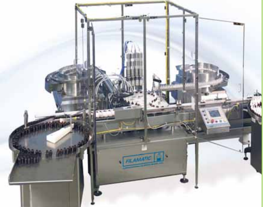
MNB XT High Speed A faster version of the MNB 2000